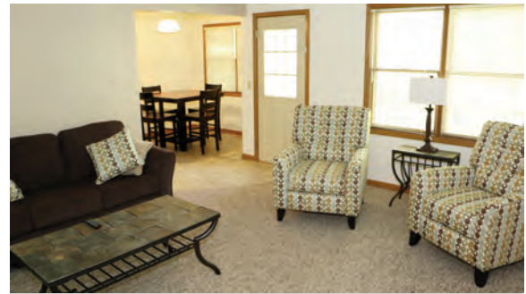
Rosecrance Woodstock Recovery Home (One of two duplexes)

Call 815.363.6132 and request an application and interview for admissions.