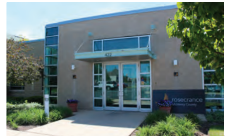
Rosecrance Crystal Lake Office