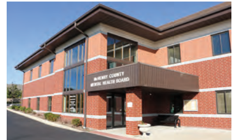
Rosecrance Dakota Clinic (Located at McHenry County Mental Health Board)