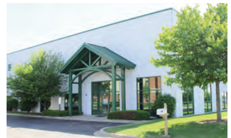
Rosecrance McHenry Office