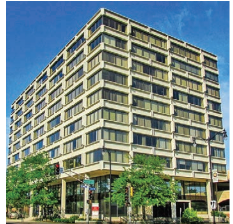
Rosecrance Des Plaines 701 Lee St. Suite 800 Des Plaines, IL 60016 847.795.3951

For an appointment or more information, call 847.795.3951